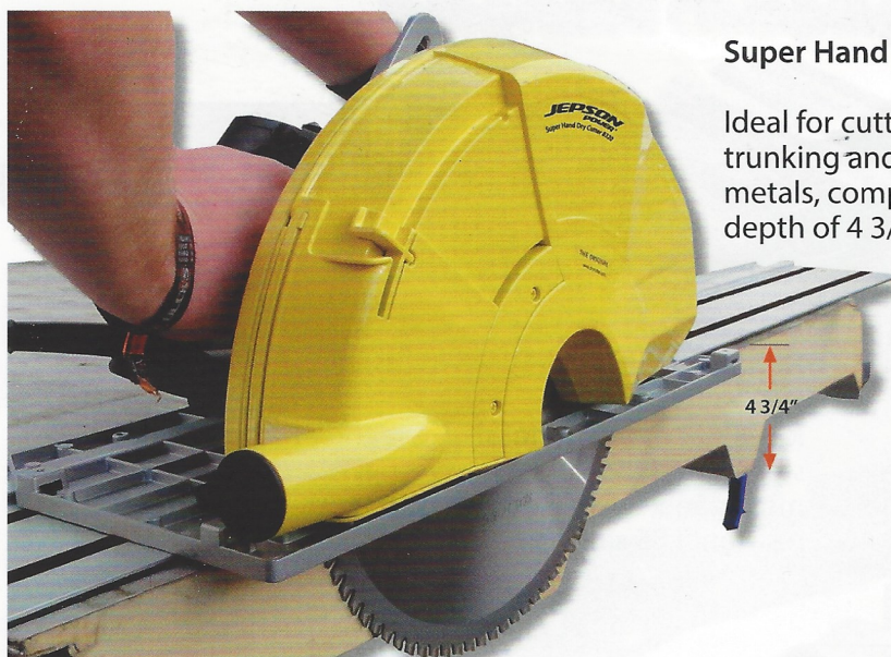
Super Hand Dry Cutter 8320 with 12 5/8"/84T saw blade

Ideal for cutting sandwich panels , trapezoidal sheets, trunking and cable ducting, steel pipes and nonferrous metals, composite materials and much more up to a cutting depth of 4 3/4"/ 120 mm on guide rail.